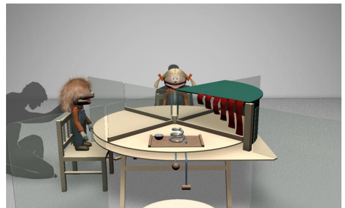
3-D image of the experimental setup.

"We've not seen this behaviour in children this young before and it does seem to indicate that pre-school children act out of concern for the welfare of a victim."