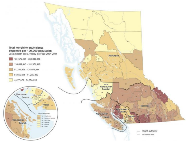
A map of opioid use in British Columbia, Canada.