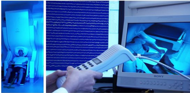
MEG at Universidad Politécnica de Madrid.

Researchers from Centre for Biomedical Technology (CTB) at Universidad Politécnica de Madrid (UPM) have shown that the abnormal pattern of functional connectivity in patients with mild cognitive impairment can be considered an indicator of the alterations in the functioning of neurons due to the onset of Alzheimer's disease.