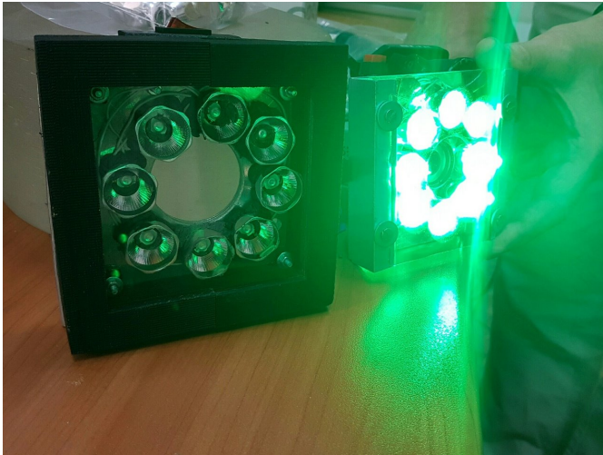
Prototype and second version of the system.