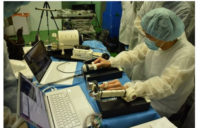
The team conducts a procedure using K-FLEX, flexible endoscopic surgical robot.

K-FLEX is made of domestically produced components, except for the endoscopic module. It will expand new medical robotics research while offering novel therapeutic capabilities for endoscopes.