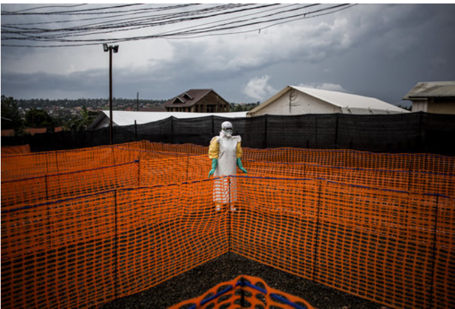
In this photo taken Wednesday, Nov. 7, 2018 and made available Tuesday, Dec. 4, 2018, a health worker waits to receive a new unconfirmed Ebola patient at a Medecins Sans Frontieres (MSF) supported Ebola treatment centre in Bunia, Congo. Congo's deadly Ebola outbreak is now the second largest in history, behind the devastating West Africa outbreak that killed thousands a few years ago, according to the World Health Organization.