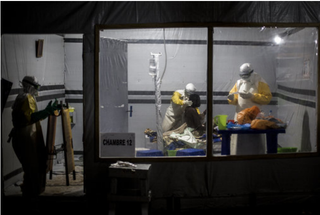
In this photo taken Saturday, Nov. 3, 2018 and made available Tuesday, Dec. 4, 2018, health workers are seen treating an unconfirmed Ebola patient inside of a Medecins Sans Frontieres (MSF) supported Ebola treatment centre in Butembo, Congo. Congo's deadly Ebola outbreak is now the second largest in history, behind the devastating West Africa outbreak that killed thousands a few years ago, according to the World Health Organization.

Wessels/Medecins Sans Frontieres via AP)