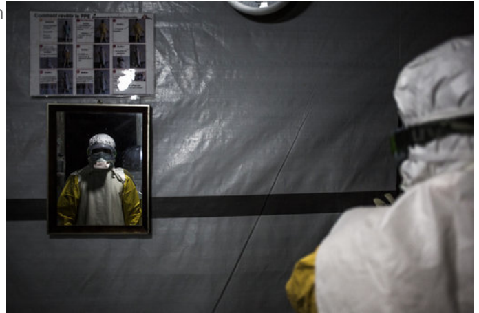
In this photo taken Saturday, Nov. 3, 2018 and made available Tuesday, Dec. 4, 2018, a health worker is seen wearing his personal protective equipment before entering the red zone of a Medecins Sans Frontieres (MSF) supported Ebola treatment centre in Butembo, Congo. Congo's deadly Ebola outbreak is now the second largest in history, behind the devastating West Africa outbreak that killed thousands a few years ago, according to the World Health Organization.

This Ebola outbreak is like no other, with deadly attacks by rebel groups forcing containment work to pause for days at a time. Some wary locals have resisted vaccinations or safe burials of Ebola victims as health workers battle misinformation in a region that has never encountered the virus before.