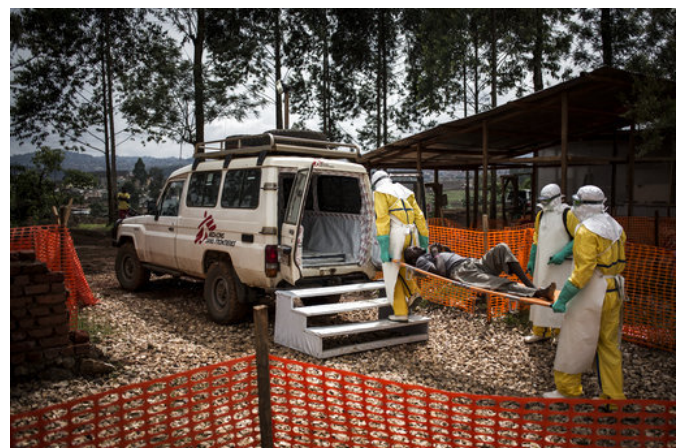
In this photo taken Sunday, Nov. 4, 2018 and made available Tuesday, Dec. 4, 2018, health workers move a patient to a hospital after he was cleared of having Ebola inside of a Medecins Sans Frontieres (MSF) supported Ebola treatment centre in Butembo, Congo. Congo's deadly Ebola outbreak is now the second largest in history, behind the devastating West Africa outbreak that