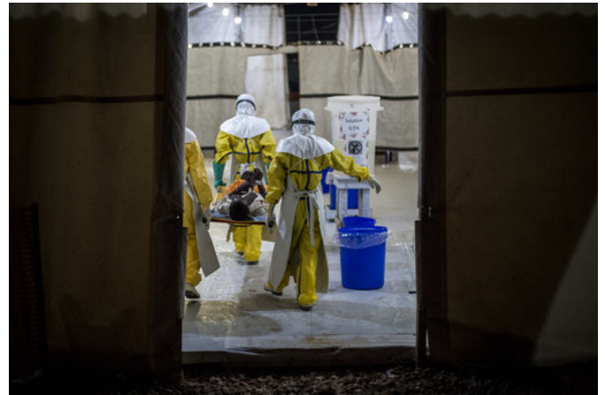
In this photo taken Saturday, Nov. 3, 2018 and made available Tuesday, Dec. 4, 2018, health workers move an Ebola patient inside of a Medecins Sans Frontieres (MSF) supported Ebola treatment centre in Butembo, Congo. Congo's deadly Ebola outbreak is now the second largest in history, behind the devastating West Africa outbreak that killed thousands a few years ago, according to the World Health Organization.