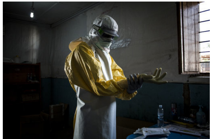
In this photo taken Tuesday, Nov. 6, 2018 and made available Tuesday, Dec. 4, 2018, a health worker is seen putting on his personal protective equipment (PPE) before entering the red zone of a Medecins Sans Frontieres (MSF) supported Ebola treatment centre in Bunia, Congo. Congo's deadly Ebola outbreak is now the second largest in history, behind the devastating West Africa outbreak that killed thousands a few years ago, according to the World Health Organization.

While she called the insecurity "very worrying," she said that with new tools at hand, including vaccines, "there is great hope."