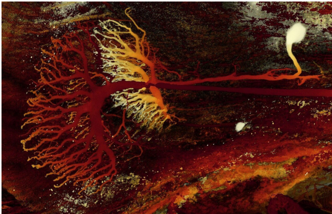
3D neuron captured under a microscope.

In stunning images captured under the microscope for the first time, the neurons were found in praying mantises. The work is published in Nature Communications today.