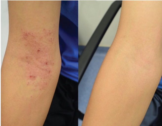
Inner elbow of a child with eczema before Roseomonas mucosa therapy (left) and after four months of treatment (right).

An experimental treatment for eczema that aims to modify the skin microbiome safely reduced disease severity and increased quality of life for children as young as 3 years of age, a National Institutes of Health study has found. These improvements persisted for up to eight months after treatment stopped, researchers report Sept. 9 in Science Translational Medicine .