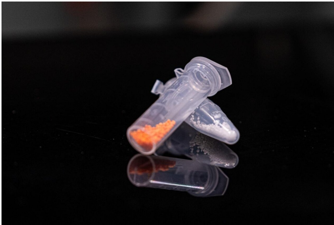
NTU Singapore scientists develop new timed-release microcapsules that can float in the stomach and release drugs over time.

Medication for the treatment of PD has an estimated pharmaceutical market size of US$8.38 billion by 2026, as reported by Fortune Business Insights in 2019.