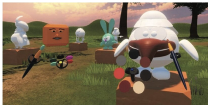
Collaborative playful activity to improve patient-therapist relationship

Images taken from the virtual reality environment of a therapy appointment.