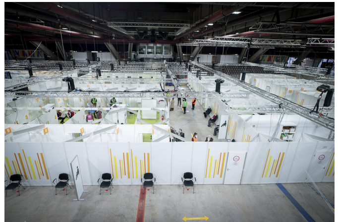
People stay in the new open Erika-Hess-Eisstadion vaccine center in Berlin, Germany, Thursday, Jan. 14, 2021.

While restaurants, most stores and schools have already been closed and those shutdowns are likely to be extended, there's also talk about possible nightly curfews, an obligation to wear the more effective FFP2 or KN95 masks on public transportation, and a push to get more people to work at home to avoid office-driven infections.