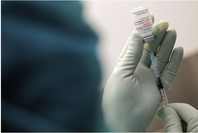
A member of staff at the university hospital prepares the Moderna vaccine against COVID-19 in Duesseldorf, Monday, Jan. 18, 2021.

While restaurants, most stores and schools have already been closed and those shutdowns are likely to be extended, there's also talk about possible nightly curfews, an obligation to wear the more effective FFP2 or KN95 masks on public transportation, and a push to get more people to work at home to avoid office-driven infections.