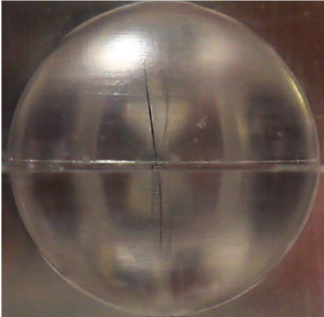
A model of a cyst that was used to test the loop brush.

In a potential step forward for early pancreatic cancer diagnosis, a miniaturized brush was successfully tested as a possible technique for loosening cells from the walls of pancreatic cysts. If proven safe to use, the technique could dramatically increase the number of cystic cells available for analysis, a key advance given the scarcity of cells in cystic fluid drawn with a needle alone.