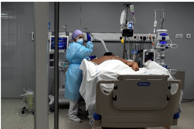
A healthcare worker attends to a patient at the Covid-19 Intermediate Care Unit at the Enfermera Isabel Zendal new emergency hospital in Madrid on January 27, 2021