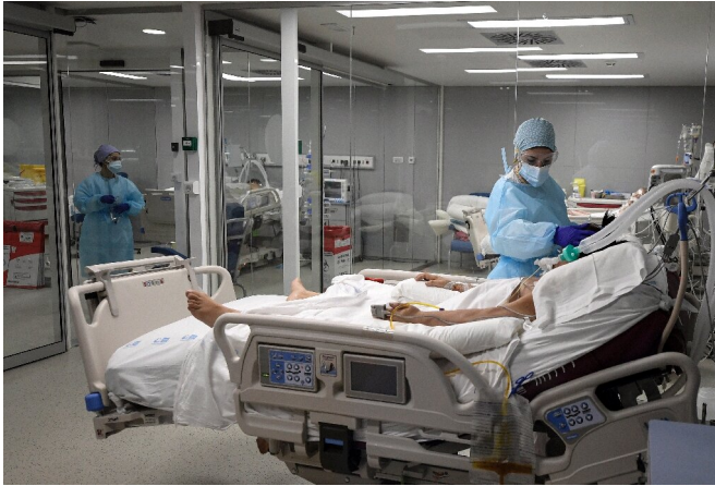
Healthcare workers attend to a patient at the Covid-19 Intermediate Care Unit (IMCU) of the Enfermera Isabel Zenda new emergency hospital, in Madrid, on January 27, 2021

With tensions soaring in Europe over vaccine supply shortages, the crisis has come to a head in Spain with regional vaccination campaigns delayed or even halted as doses run out.