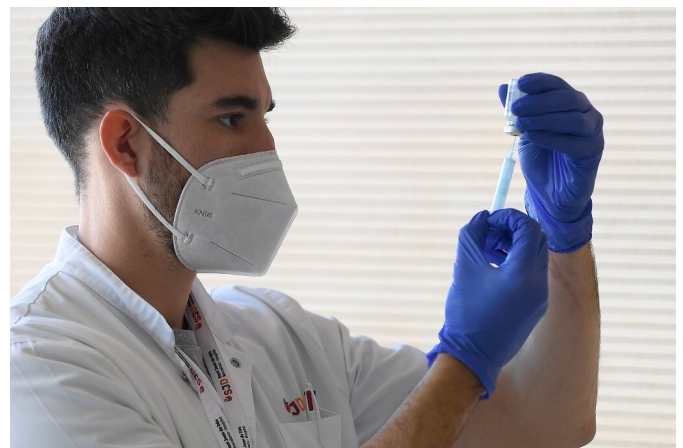
A medical worker prepares a Moderna Covid-19 vaccine at the Hospital Sant Joan de Deu in Barcelona on January 16, 2021

"Since no vaccines arrived last week, we had to draw on the strategic reserve that was gradually running out, so we stopped at the weekend so we could continue on Monday with what was left," a regional health ministry source told AFP.